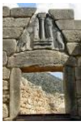
1150 BC Ruins of Dorian Invasion