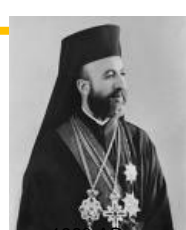
1960 AD Makarios