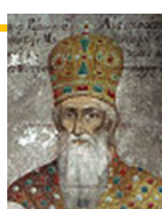
Andronicus II Palaeologus