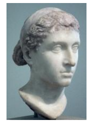
45 BC Cleopatra