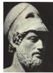
450 BC Pericles