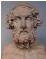
750 BC Homer