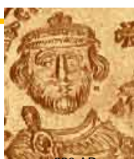
620 AD Heraclius