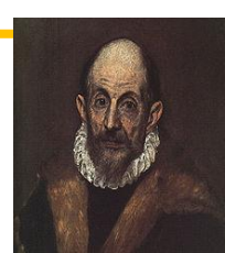
Domenikos Theotokopoulos (El Greco)