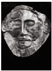
1500 BC Mycenaean Mask